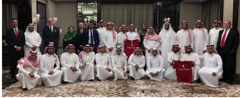
The IU delegation met with alumni in Riyadh as part of their Saudi Arabia trip.